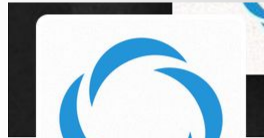
Life Teen @LifeTeen