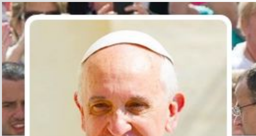
Pope Francis ✓ @Pontifex